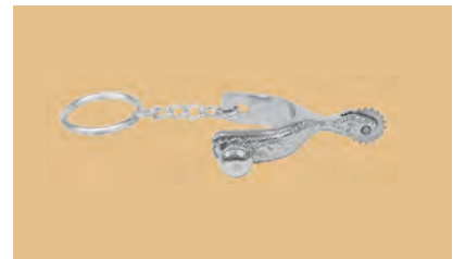
NO.2862 ENGRAVED SPUR KEY CHAIN Never rust and steel with a double end to keep keys separate. N/P Size:W25mm(1")xL50mm(2") 500/Box