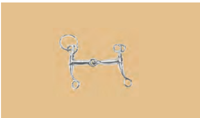
NO.2854 TOM THUMB KEY CHAIN Never rust and steel with a double end to keep keys separate. N/P Size:W54mm(2-1/8")xL70mm(2-3/4") 500/Box