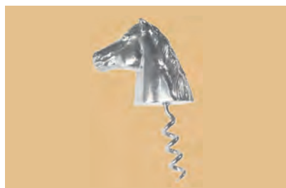
NO.2859 BOTTLE OPENER Stainless steel horsehead Size:L135mmxW145mm 100/Box