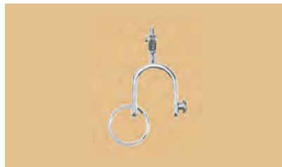
NO.2853 SPUR KEY CHAIN Never rust and steel with a double end to keep keys separate. N/P Size:W25mm(1")xL50mm(2") 500/Box