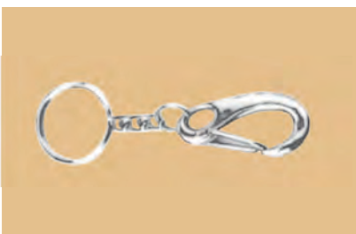
NO.2813 KEY CHAIN Stainless steel Size:length 50mm(2") 500/Box