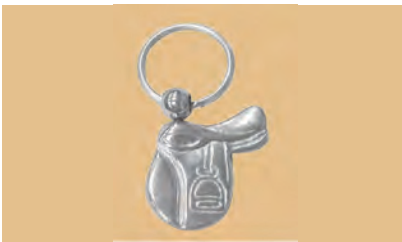
NO.2861 SADDLE KEY CHAIN solid brass and steel with swivel Length:43mm Width:38mm Weight:30g 500/Box