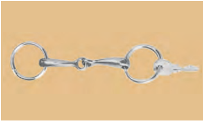
NO.2805 SNAFFLE BIT KEY CHAIN Copper and steel with a double end to keep keys separate 11.5cm(4-1/2") 1000/Box