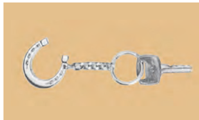
NO.2860 HORSE SHOE KEY CHAIN Never rust and steel with a double end to keep keys separate golden plated Size:W31mm(1-1/4")xL31mm(1-1/4") 500/Box