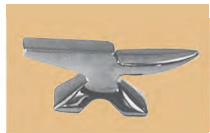
NO.2849 MINI ANVIL stainless steel Size:L115xW35xH42mm L(4-1/2")xW(1-3/8")xH(1-3/4") Weight:420g 50/Box