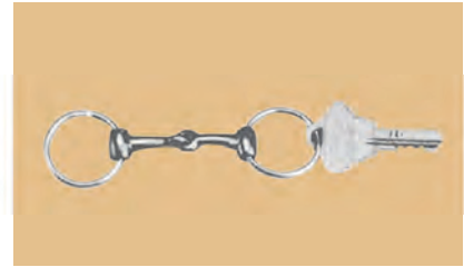
NO.2808 EGG BUTT KEY CHAIN Solid brass and steel ring (B/P) with a double end 11cm(4-5/8") 1000/Box